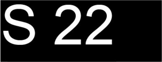
FIGURE 31: TIKTOK IN-FEED AD EXAMPLE